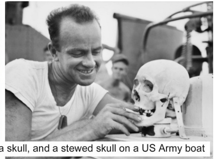
US troops "skull stewing" removing the skin from a skull, and a stewed skull on a US Army boat